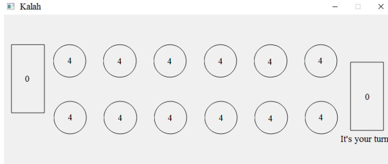
Fig. 2. The application GUI main window.

We do let concisely introduce the simple GUI programmed for verification of the designed algorithms. When starting the application, a window enabling the decision whether a human-being or the computer starts is released. This is very important feature that may significantly contribute to the game result. Then, the player can decide what strategy is to be used. There are 5 options here; namely, the deterministic algorithm or the modified tree-search strategy with the value of STOP_ITERATION from 1 to 4. After this selection, the main window (see Fig. 2 ). The human-being player (Player 1) is always situated on the Southside. When the game is over, a short summary of the game is displayed (who won, the eventual numbers of stored counters).