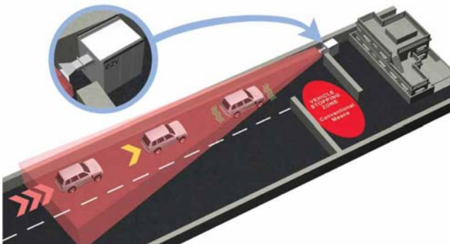
Fig. 7 Application of the system RF Safe Stop [5]

Deployment of the system RF Safe Stop in stationary installation on the control point shown in the Fig. 7. The motors of vehicles are capable of re-operation after a forced stopping, but in some cases is required disconnect the battery. The device does not have a negative effect on people's health.