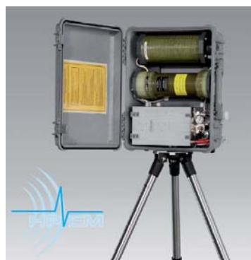
Fig. 5 System for protecting buildings and persons HPEMcase [4]

Another device that can be used alternatively to stop the vehicle is a portable, battery system HPEMcase (Fig. 5), whose primary destination is the deactivation of electronics (computer equipment, data centres, eavesdropping devices, security alarm systems, etc.). In the framework the protection of objects the system can be used at points of control the entry of persons (against the suicide bombers or intelligence technology). The maximum intensity of the EM field is 160 kV/m or 300 kV/m with the reflector at a distance of 1 m from the antenna.