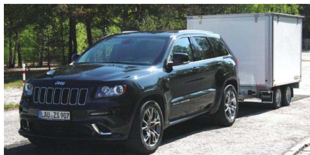
Fig. 3 The system stopping of vehicles HPEMcheckPoint [3]

System HPEMcheckPoint (Fig. 3) from the same manufacturer is designed the stopping of vehicles at checkpoints and important objects (e.g. the critical infrastructure). It combines a system HPEMcarStop with another source HPEM which is located on the trailer. Fig. 4 shows a possible scenario of system deployment when the target vehicle is exposed to the EMP in position 2 (HPEM in the trailer) and other HPEM device in the vehicle is designed as a backup.