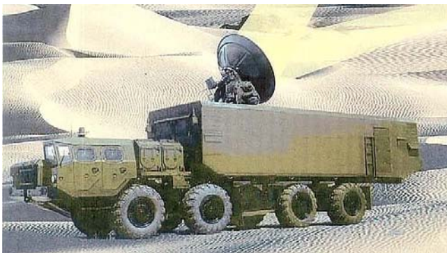
Fig. 1 HPM weapon system Ranets-E [1]

stationary equipment. For example the reach of the mobile HPM weapon system Ranets-E (Russia) (Fig. 1) is up to 40 km (intensity of electric field of 1 kV/m) while at a distance of 2 km it generates EM field with an intensity of 19 kV/m.