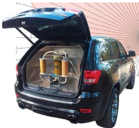
Fig. 2 The system stopping of vehicles HPEMcarStop [2]

In the world the research and development of electromagnetic weapon is engaged a wide number of governmental and private organizations, including universities. A significant position in this field they are primarily USA, Russia and China. Other countries such as Germany, France, Australia, India, Japan, Israel, South Korea is also concerned with the issue of HPM in the long time. Czech Republic was also represented in this issue in special panels of as part of NATO Science and Technology Organization, such as Tactical Implications of High Power Microwaves, HPM Threat to Infrastructure and Military Equipment, HPM and Directed Energy Weapons. Research and development conducted in the Czech Republic for example in the field of high power of microwaves generators or the protection of military facilities against the effects of power electromagnetic field, under the direction of VTUPV Vyskov.