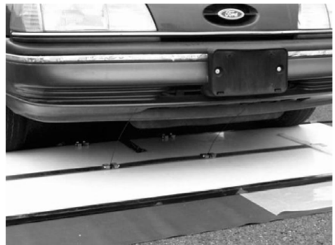
Fig. 9 Electrical Vehicle Stopper [8]

In the past the company Army Research Laboratory also dealt of similar problems, but with a different approach to the penetration of the EMP. They developed system EVS (Electrical Vehicle Stopper) (Fig. 9) in collaboration with the National Institute of Justice. This system used generators (180 kV) instead of using the directional antennas. These generators are connected to spring electrodes which have been installed in the plates on the roadway. When passing the vehicle via the air hoses the voltage is connected to the