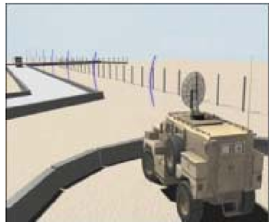
Fig. 8 Vehicle Stopper [7]

Similarly as the development of HPEMS of company Eureka Aerospace been implemented in cooperation with the armed forces, in this case the USMC (United States Marine Corps). A number of other elements of the armed forces is also involved on the development of equipment that uses the EMP as a weapon instrument. Significant role in the US Armed Forces constitutes JNLWD - Joint Non-Lethal Weapons Directorate, which controls, supports and coordinates research and development in the field of non-lethal weapons. Within the framework of its activities is also involved in the development of means to stopping of vehicles and ships (in cooperation with the L-3 Electron Devices, USA), which include the systems of multi-frequency/radio-frequency Vehicle Stopper (Fig. 8), radio frequency Vessel Stopper or Non-Lethal Unmanned Aerial Vehicle High Power Microwave Payload. The system Vehicle Stopper is designed primarily for the protection of the army and it is expected deployment on the access points, checkpoints, at roadblocks or for mobile patrols. The system will be designed as a portable simultaneously are developed systems for stopping the motor vessels that will be installed on a ship or on air pilotless devices.