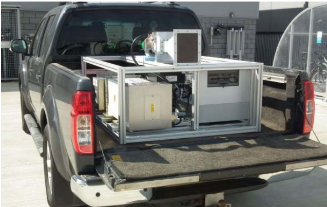
Fig. 6 Installing the system RF Safe Stop [5]

British company e2v (Chelmsford, England) within its manufacturing program, which is also focused on microwave devices for military and civilian purposes, this company offers a system RF Safe Stop (Fig. 6). This system allows by installation terrestrial and naval deployment. The system is intended to stopping the vehicles within the control points, the protection of convoys and other relevant actions. This system can use the marine police for the protection entrances to harbors or stopping the motor vessels. The device has a weight of 350 kg and a working distance up to 50 m. In practice it is installed e.g. on vehicles Nissan Navara or Toyota Land Cruisers. The device is capable of operating in a total time of 12 minutes on one charge, however, the effect of EMP with length of 3 s is sufficient for stop the vehicle.