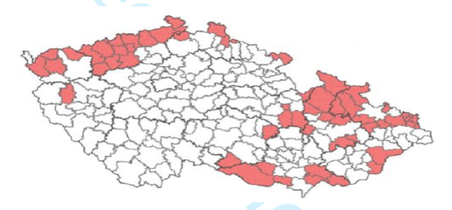
Figure 3. Results of spatial autocorrelation testing in case of Czechia

While the regions with concentrated state support are mostly located in the eastern part and near the borders in the northern part of the Czechia, these regions do not demonstrate the sings of the spatial autocorrelation in case of the questions 1 and 4. Figure 3 shows the map of Economically problematic regions (Ministry of Local Development of Czech Republic, 2013).