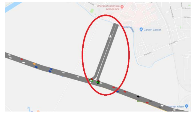
Fig. 5. New road to the hospital [author].

Because of the required capacity, a crossroads, a three-armed T-junction, were used. [17]