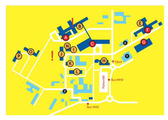
Fig. 4. Areal of the hospital with the building of the CT and magnetic resonance [14].

The following figure shows the buildings in which the selected devices are used. Magnetic resonance is located in building J and CT in building B.