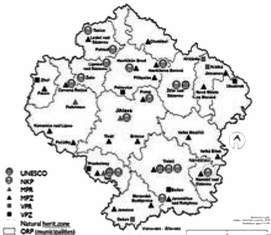
Fig. 4 Cultural monuments in Vysočina region (NKP=national historic landmark; MPR=urban conservation area; MPZ=urban conservation zone; VPR=village conservation area; VPZ=village conservation zone).