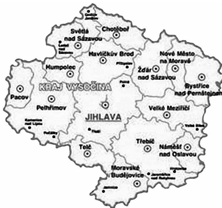
Fig. 3 District and municipalities with extended competences (ORP's) in Vysocina region.

In our analysis of the tourism potential in the Vysocina region we decided to compare selected municipalities inside this region. As there are only 5 districts in Vysocina region it is not enough for the DEA model. It is not possible to obtain the relevant data for all 704 municipalities, so we analyzed the municipalities with extended competence referred to as ORO in Czech (15 in Vysocina region). These municipalities lie between the NUTS IV (LAU 1) – districts (5 in Vysocina region), and NUTS V (LAU 2) – municipalities (704 in Vysocina region) – Fig. 3.