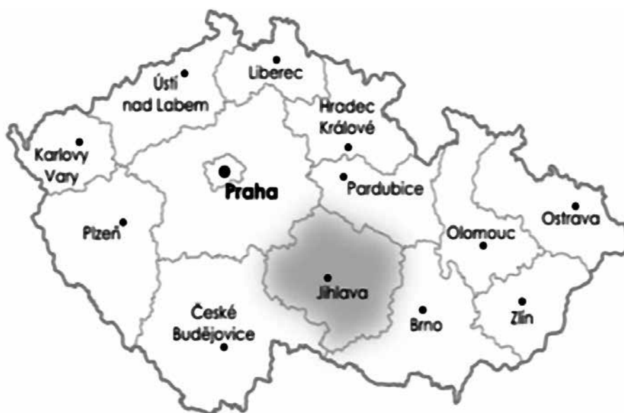
Fig. 2 Czech Republic and the Vysocina region (in blue).

Our comparison is aimed at the Vysocina region as one of the 14 regions in the Czech Republic. This region lies in the center of the Czech Republic between Bohemia and Moravia and its main region city is Jihlava (Fig.2).