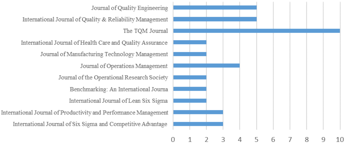
Fig. 1 - Number of published articles per journal.

Considering all first authors as well as their co-authors, a total of 143 researchers contributed to the selected 62 articles (see figure 2). Almost half of all authors come from the USA. This also leads to the fact that most of the studies were conducted with US companies and experts. 40 papers focused their research on a specific country. The global distribution of the SS belt research demonstrates that 18 studies were conducted in the USA, followed by Asian countries (5 studies), the UK (6 studies) and the rest of Europe (6 studies) (figure 3). The second largest share of authors which makes almost 25% comes from the UK (see figure 2). This also includes Jiju Antony of the University of Strathclyde in Glasgow who is the most published researcher in this research field. Overall, he contributed to 15 research papers. He is the lead author of five papers, and a single author of three papers and a co-author of three more papers.