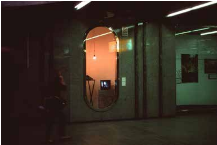
Fig. 3: NIKA Gallery. Academy of Arts. Architecture and Design in Prague.

The diversity of university gallery concepts demonstrated in the Czech Republic, Slovakia