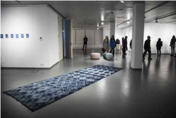
Fig. 2: G18 Gallery. Tomas Bata University in Zlín.

Non-collection-based university galleries, that is, exhibition-oriented university galleries that do not have their own collections, based on the concept of exhibition halls, known as Kunsthallen in Germany. These are a popular concept not only in the Czech Republic and Slovakia but also in Poland, Ukraine and other European countries. Representatives of this category can be found all around Europe and include Angewandte Innovation Lab in Vienna, Exhibition Laboratory in Helsinki, designtransfer in Berlin and many others. This type of university gallery has a well-defined staff structure, typically accompanied by a clear division of roles, staffed mostly by academic or administrative employees of the university. They tend to have regular exhibition plans, in which each exhibition cycle is clearly defined in terms of timeframe, topic and organization.