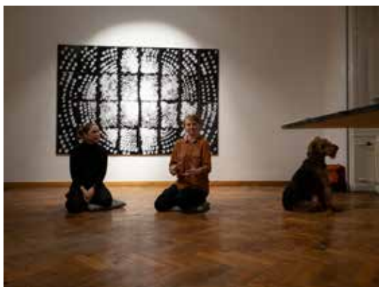
Fig. 4: Medium Gallery. Academy of Fine Arts and Design in Bratislava.

The past two decades have been something of a golden age for non-collection-based university galleries, which has been reflected in the content of their exhibitions as well as the role they perform, and not only within the academic sphere. The topic of university galleries in the Czech Republic is finally at the forefront of discussion, which is demonstrated by the establishment of an academic conference dedicated specifically to university galleries (Univerzitní galerie – Tradice, výstavní praxe a edukační potenciál), whose aim is to “bring attention to the importance of university galleries as a first space in which students