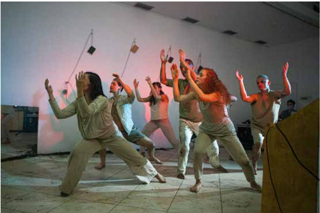
Fig. 1: AMU Gallery. The Academy of Performing Arts in Prague.

Once we attempt to define the term itself, we can further examine various types of university gallery, unearthing a potential for more efficient synergies within their activities and studying the different variants of their audience engagement efforts.