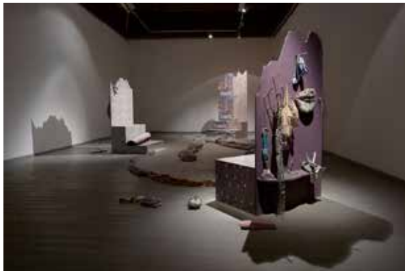
Fig. 6: UM Gallery. Academy of Arts. Architecture and Design in Prague.

Generally speaking, university galleries all converge on their interest in stimulating young audiences, who do not necessarily have to come from the ranks of students of the respective university. It is in the best interest of university galleries to attract broader audiences, which can even include students of secondary and elementary art schools in the region, ideal for their specialization, or potential university applicants, for whom the gallery can serve as a platform from which the university can appeal to them. It is therefore not uncommon to see university galleries in the Czech Republic and Slovakia adapt a large part of their activities to this target group. Nevertheless, promotion of these activities forms only a small part of the complex approach of university galleries towards civil society. Educating and cultivating young people, connecting them and motivating them to engage in interdisciplinary cooperation, constitutes