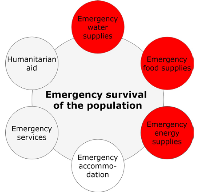
Fig. 2. Emergency survival of the population [author].

There may also be emergency accommodation, necessary emergency services and the organization of humanitarian aid. It should be noted. However, that evacuation of the entire hospital, such as the county hospital, cannot be carried out. If there was a crisis - a flood and the buildings of a health care facility were at risk, it would be sufficient to evacuate only within the building. It is, therefore, necessary for patients to evacuate from the ground floor of the building to the upper floors, along with the staff and the appropriate devices.