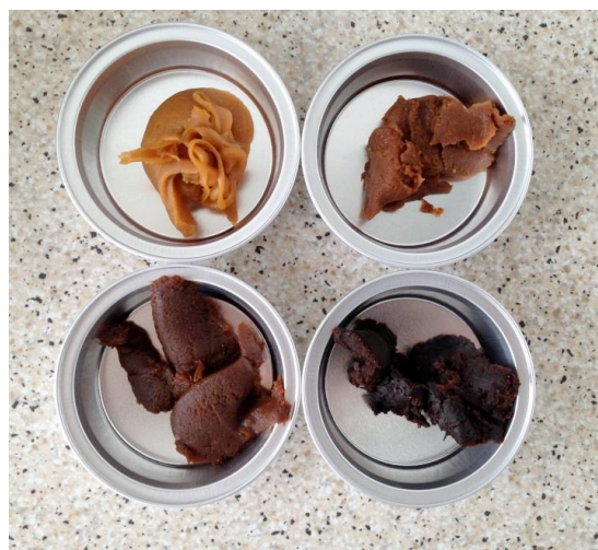
Figure 1 Various types of miso paste (top left - shiro miso, top right – mugi miso, lower left - hacho miso, lower right - genmai miso).

Lyophilised soya products were used for the biogenic amines (BA) and polyamines (PA) analysis. Triple extraction of BA and PA from the lyophilised samples was carried out using a perchloric acid solution (0.6 mol.L -1 ). Three independent extractions were performed on each soya product sample. The filtrated extract (filter porosity 0.45 µm) was then used directly for the derivatisation and determination of BA/PA content (Dadáková et al., 2009; Buňková et al., 2013) that followed.