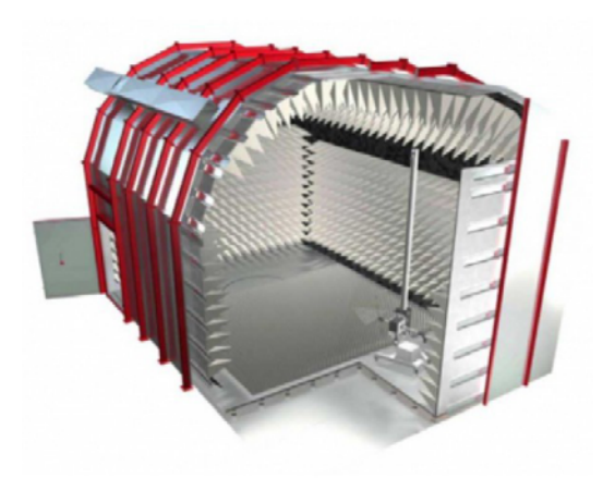
Fig. 4. Frankonia SAC 3 plus.

The construction of the chamber is specific for its cylindrically shaped ceiling. The manufacturer claims that the dome shaped roof as well as its optimized absorber layout, with ferrite and partial hybrid absorber lining, minimizes the reflections in between 26 MHz and 18 GHz [8].