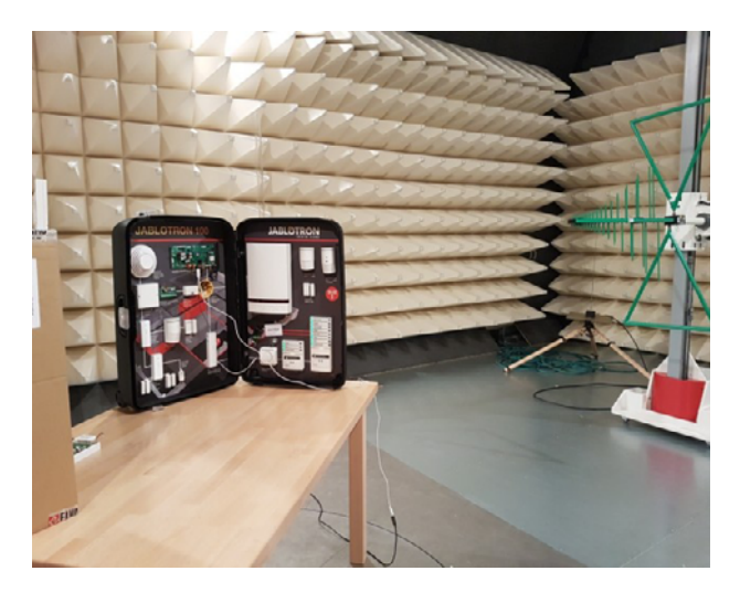
Fig. 5. Safety system Jablotron JA 100 inside the semi anechoic chamber.